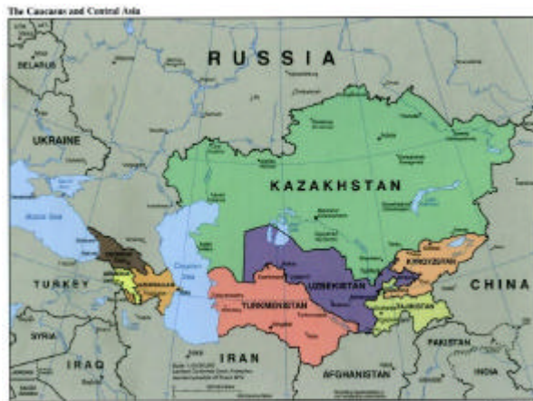
Figure 1 The Countries participating in the SILK Project

During recent years the Panel has been concentrating on the Southern Caucasus (comprising Armenia, Azerbaijan and Georgia), and Central Asia (comprising Kazakhstan, Kyrgyz Republic, Tajikistan, Turkmenistan and Uzbekistan). These countries are located on the fringe of the European Internet arena and will not be in reach of affordable optical fibre connections within the next few years. However, Internet connectivity via satellite is also an expensive, and therefore a scarce, resource for the science and education community in these countries. As a result the bandwidth available for the whole research and educational community in these countries ranged from 64 Kbps to 384 Kbps (Megabits/second) per country. To alleviate this, the Advisory Panel on Computer Networking (the Panel) of NATO has taken the initiative to launch the SILK project with a grant to DESY as the Western Co-Director, and the NRENs of the above eight countries (the grantees).